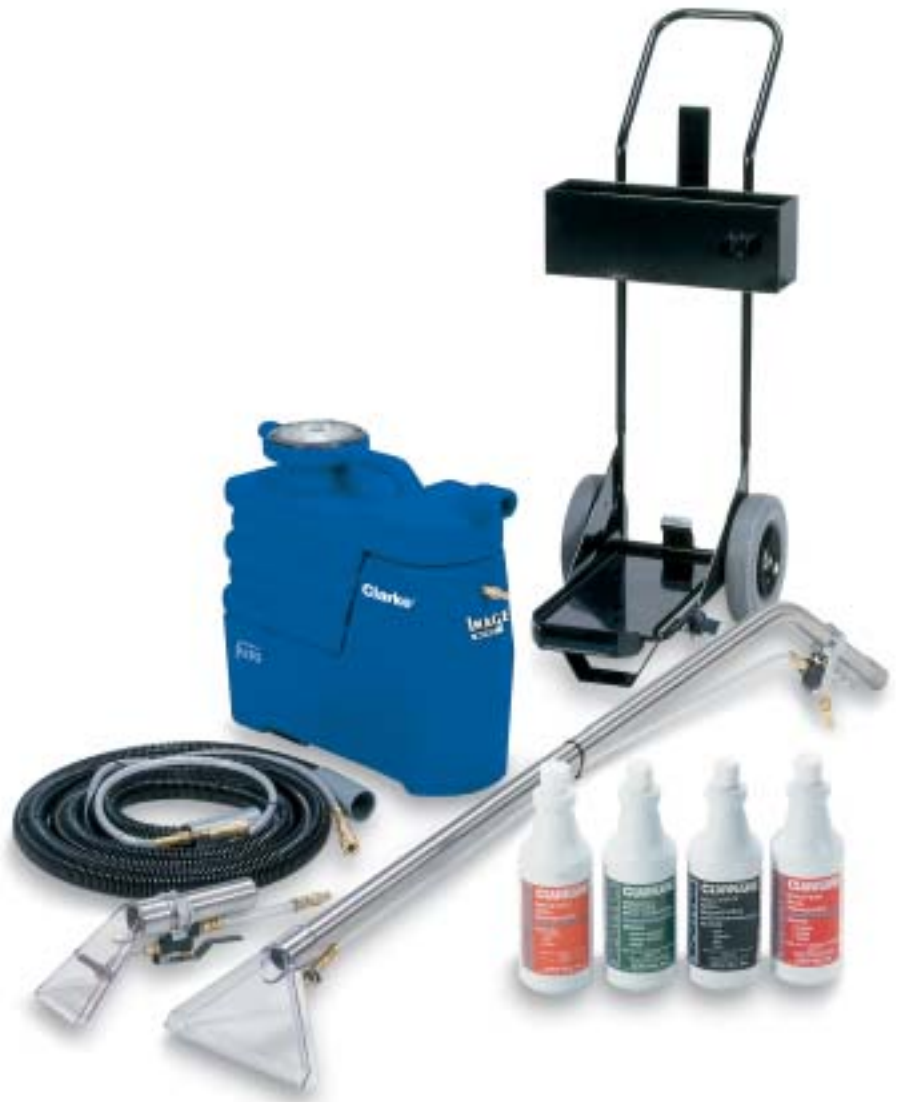
Image Mini Spot Carpet Spot Cleaning System