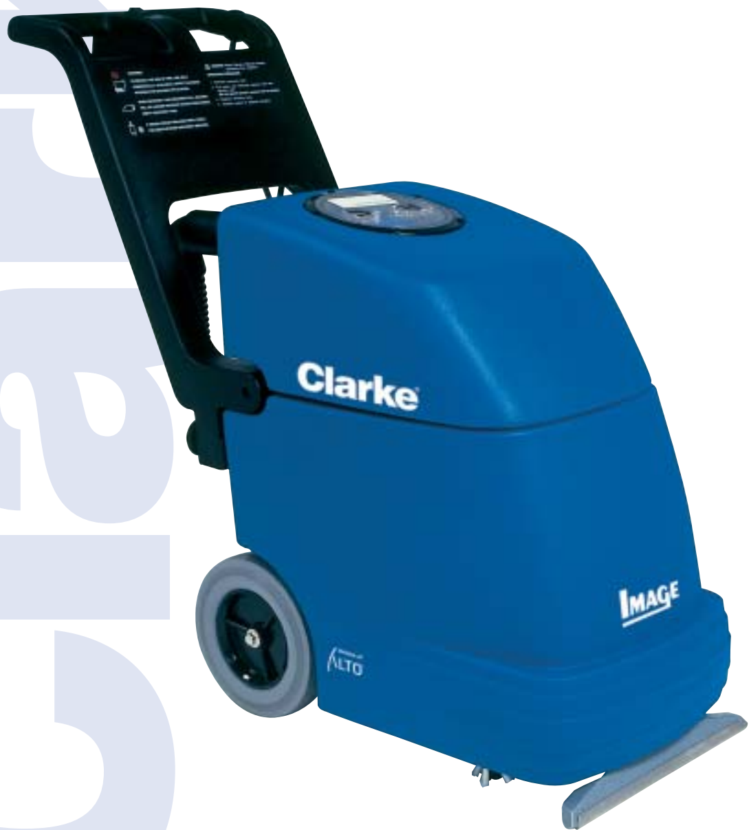
Image 14 Compact Self Contained Extractor