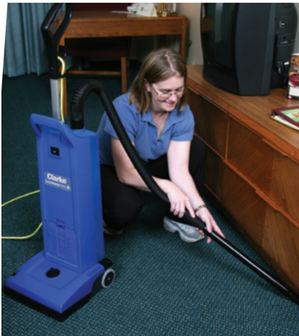
Easy to use quick-draw detailing wand and tools.