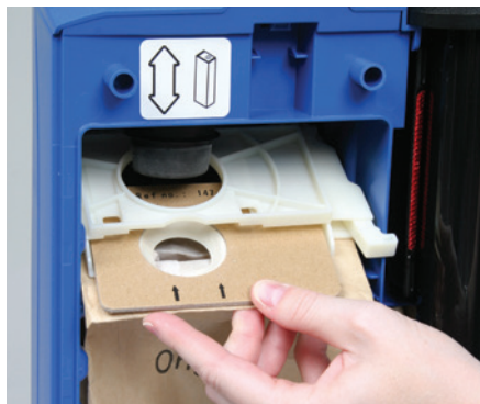
Quick and simple bag replacement. Just lower the bag holder and pull your used bag out, then slide in a new bag and snap holder back into place. Easy as 1-2-3!