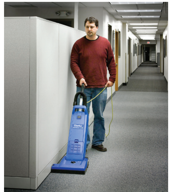
Light handle weight won't fatigue the operator.

Unlike most dual-motor vacuums, the CarpetMaster has its vacuum motor located at the base of the machine. The result is a lighter handle weight. That means less fatigue for the operator.