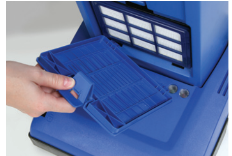
Convenient access to standard H.E.P.A. filter.