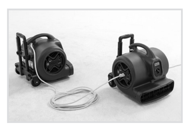
GFCI outlets allow daisy chain of up to 3 units.