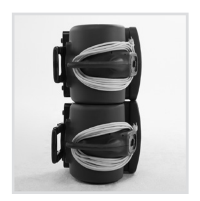
Conveniently stacks for storage.