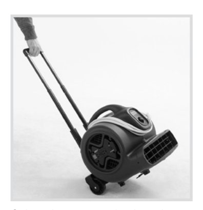
Onboard transport wheels and telescopic handle.