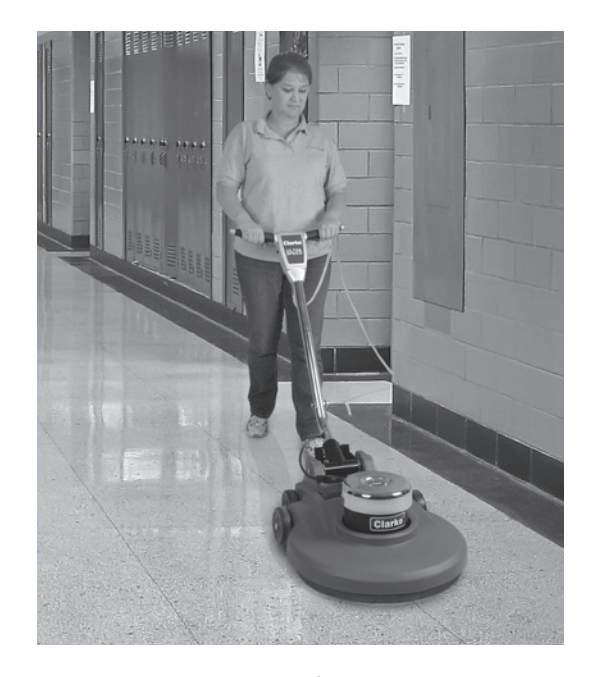
The Ultra Speed series is ideal for hospitals, schools and areas requiring dust-free and quiet operation.