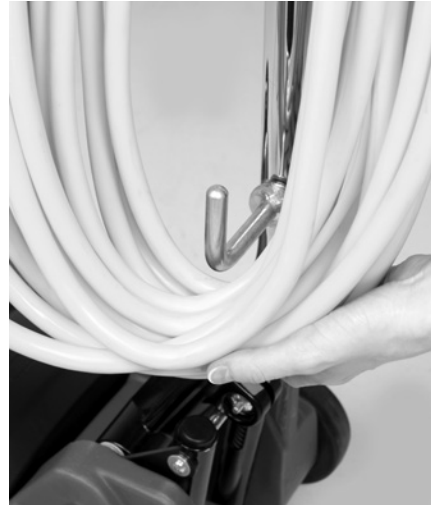
A quick release cord wrap assists the removal of the power cable without unwrapping.