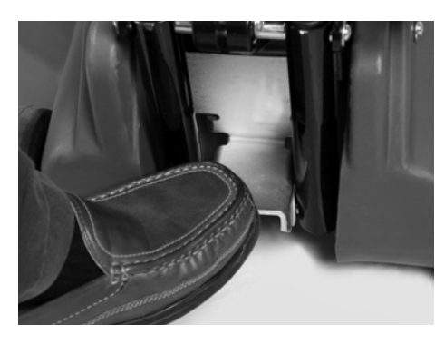
Easy-to-operate pedal releases the control handle to the operate or storage position.