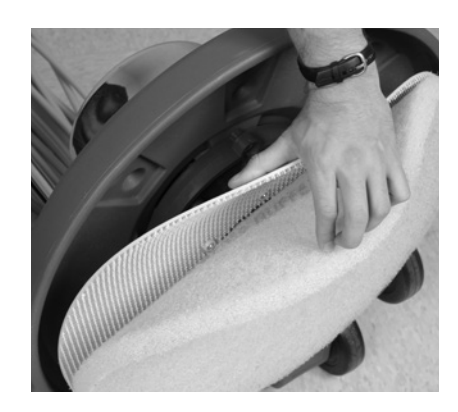
Flexible pad driver with full face pad grip contours to uneven floors.