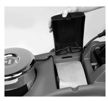
Passive dust control eliminates airborne dust and collects it in a convenient filter bag.