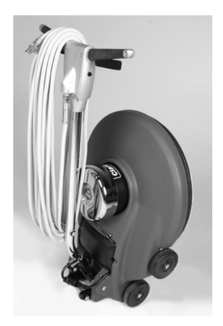
The folding handle permits the burnisher to fit into storage spaces.