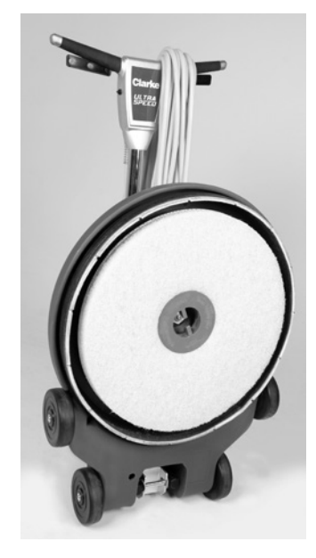
The upright storage position allows for easy pad change.