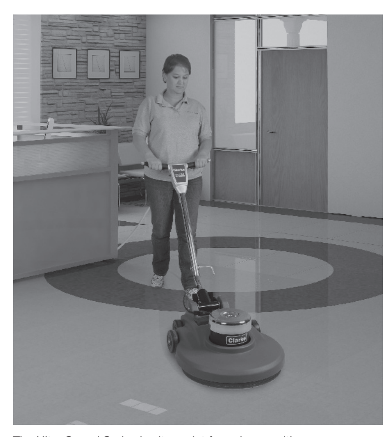
The Ultra Speed Series is ultra quiet for noise sensitive areas.

The Ultra Speed Series line of corded burnishers have the latest in innovative features that provide the highest shine with minimum effort. The self-adjusting pad pressure assures optimal power is applied to the pad driver without the need to change any settings or make adjustments. The Ultra Speed Series is lightweight, easy to maneuver, and is very quiet when working in noise sensitive areas. The powerful motor supplies the highest power permitted from a wall outlet.