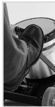
Foot-activated handle lock.