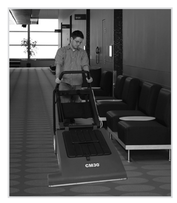
The CarpetMaster® 30 is the only choice for large area cleaning needs.