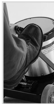
Foot-activated handle lock.