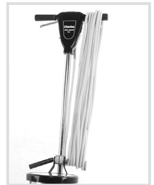
50 ft safety yellow cord.