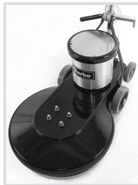
Cast aluminum chassis.