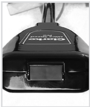
Safety lock-out switch.

The Ultra Speed Pro ® 1500 features a powerful DC rectified motor that drives a consistent 1,500 rpm's to maintain a wet-look shine on finished floors. With easy-to-use fingertip controls and multiple safety features, such as handle-mounted safety switch and circuit breaker, and a 50 foot yellow cord, this machine gets the job done fast. The handle can be operated on the locked position or allowed to float. A flexible pad driver is included.