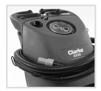
Retractable hose wrap holds your vacuum and solution hoses.