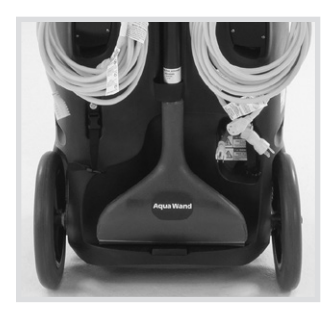
Wand caddy is molded into the machine for easy access and transport.