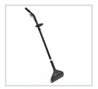
The EX30<sup>™</sup> comes standard with a lightweight 12 inch rotationally molded AquaWand<sup>™</sup>.