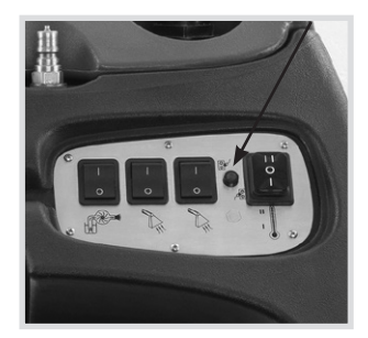
Smart circuit locator identifies separate lines to eliminate blown circuits.