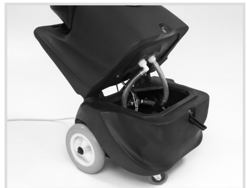
Clamshell design for easy servicing.