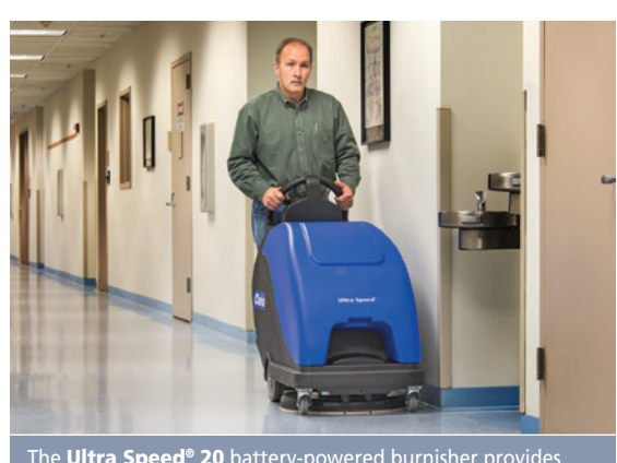
The Ultra Speed® 20 battery-powered burnisher provides superior dust control for improved indoor air quality.

Manager of Environmental Services Adirondack Medical Center, Saranac Lake, NY