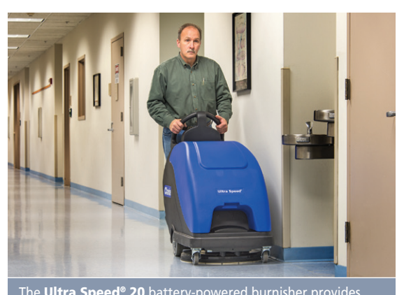
The Ultra Speed® 20 battery-powered burnisher provides superior dust control for improved indoor air quality.

Manager of Environmental Services Adirondack Medical Center, Saranac Lake, NY