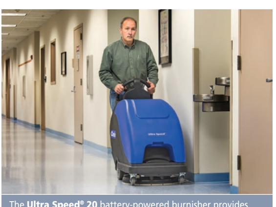
The Ultra Speed® 20 battery-powered burnisher provides superior dust control for improved indoor air quality.

Manager of Environmental Services Adirondack Medical Center, Saranac Lake, NY