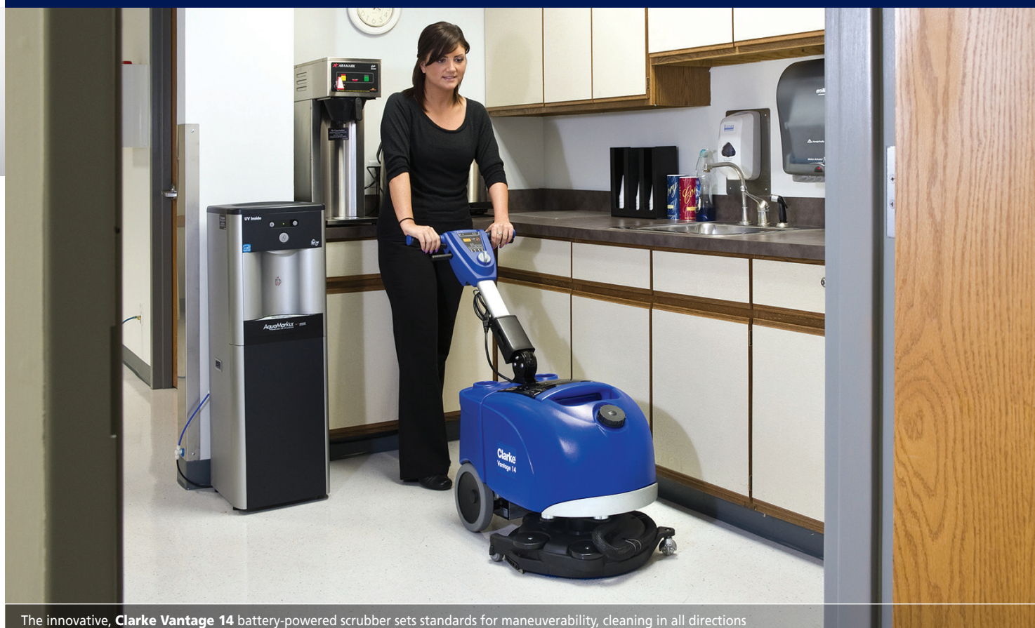
and keeping water contained under the deck to effortlessly deliver a scrubbed dry surface.