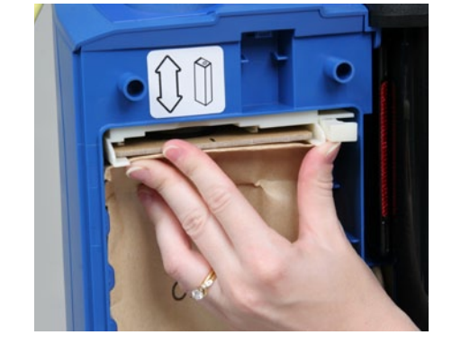
Quick and simple bag replacement. Just lower the bag holder and pull your used bag out, then slide in a new bag and snap holder back into place. Easy as 1-2-3!