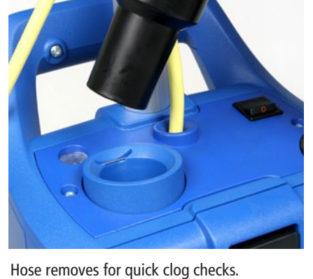
Tool and storage compartment is located directly