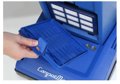
Convenient access to standard H.E.P.A. filter.