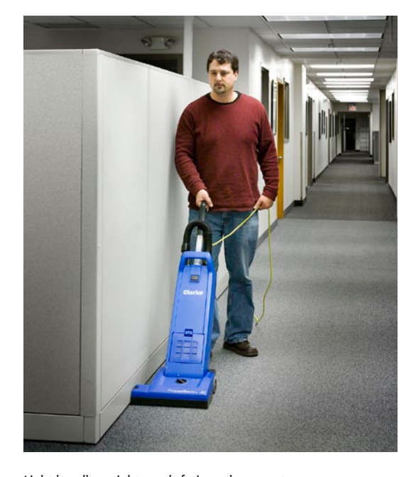
Light handle weight won't fatigue the operator.