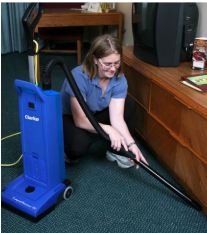
Easy to use quick-draw detailing wand and tools.