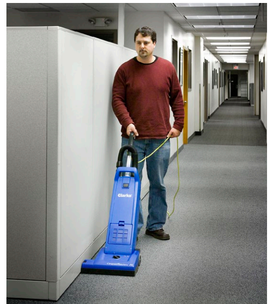
Light handle weight won't fatigue the operator.

Unlike most dual-motor vacuums, the CarpetMaster has its vacuum motor located at the base of the machine. The result is a lighter handle weight. That means less fatigue for the operator.