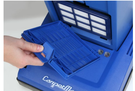
Convenient access to standard H.E.P.A. filter.