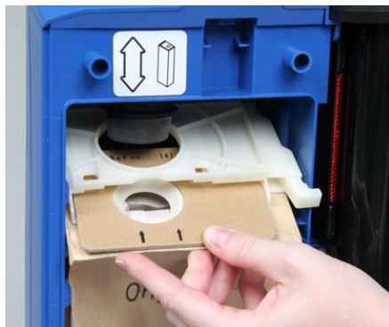
Quick and simple bag replacement. Just lower the bag holder and pull your used bag out, then slide in a new bag and snap holder back into place. Easy as 1-2-3!