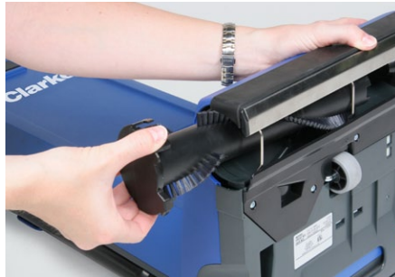
Easy to change brush. Simply unlock the brush and pull out.