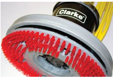
Short cut bristle pad driver comes standard with polisher.