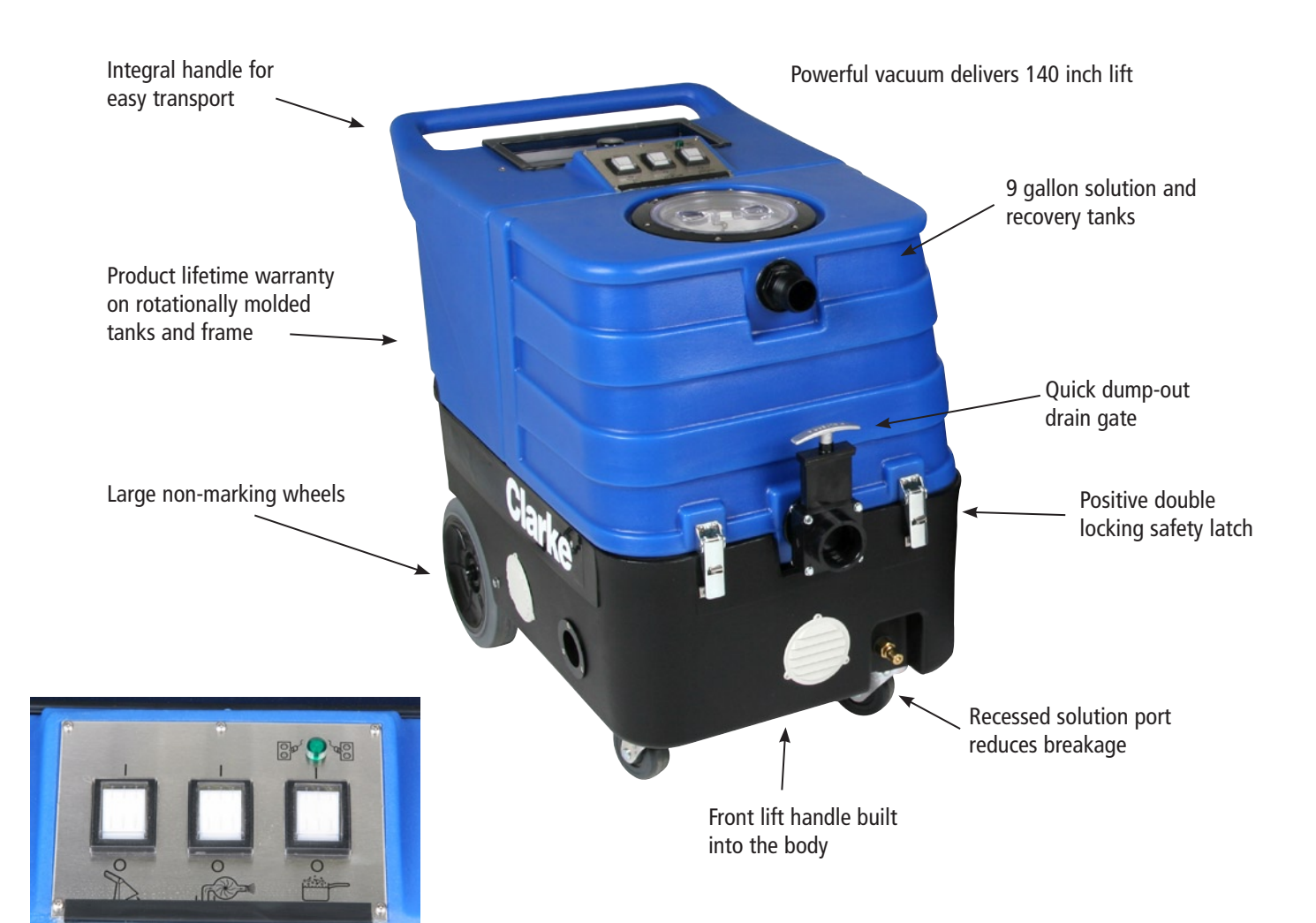
Lighted rocker switches with sealed switch plate and switches