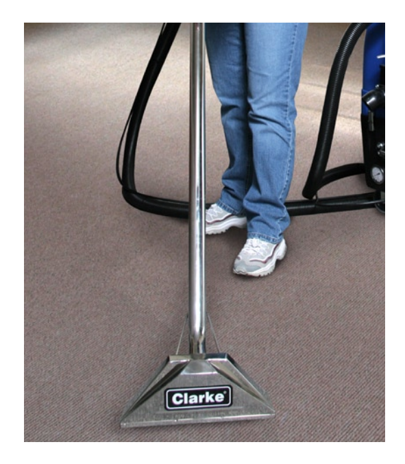
The \text{Bext}^{\circledast} 100 extractor provides portable, heated, box extraction equipment.