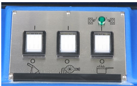
Lighted rocker switches with sealed switch plate and switches