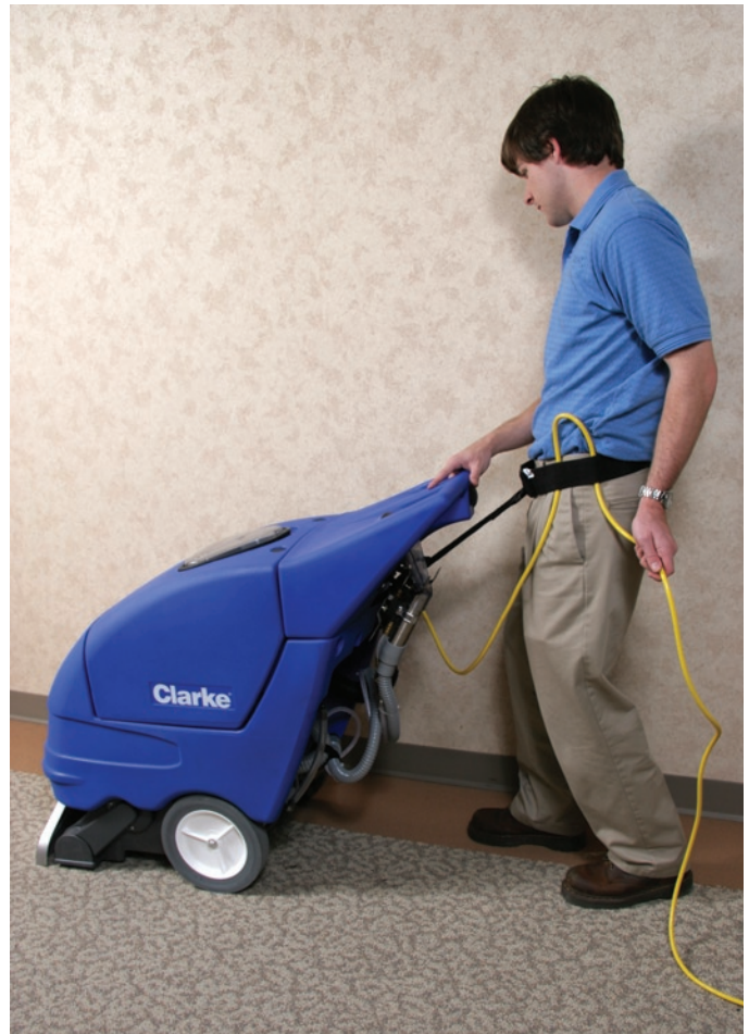
The Clean Track series machines are classified by Clarke as green machines by reducing operator strain.