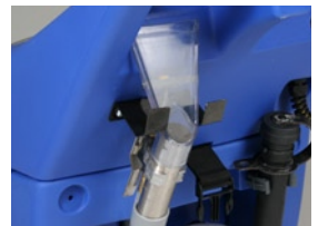
Integrated options – onboard spotting and hand tool.