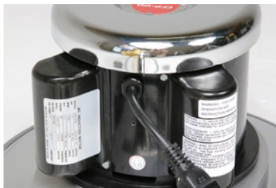
Powerful motors in both 1 hp and 1.5 hp have dual capacitors to maximize startup and run torque.