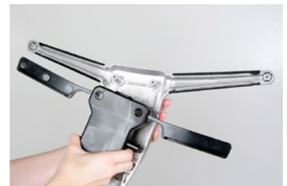
The simple modular switch design promotes fast and easy repairs to minimize maintenance costs.