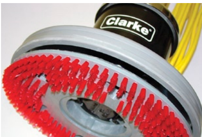
Short cut bristle pad driver comes standard with polisher.