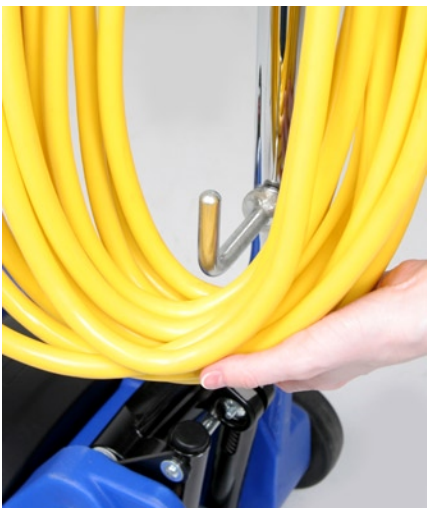
A quick release cord wrap assists the removal of the power cable without unwrapping.