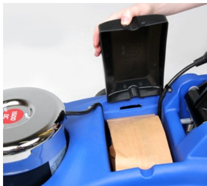
Passive dust control eliminates airborne dust and collects it in a convenient filter bag.