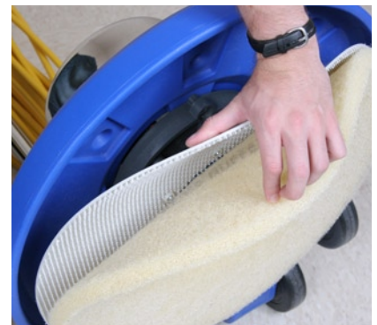
Flexible pad driver with full face pad grip contours to uneven floors.