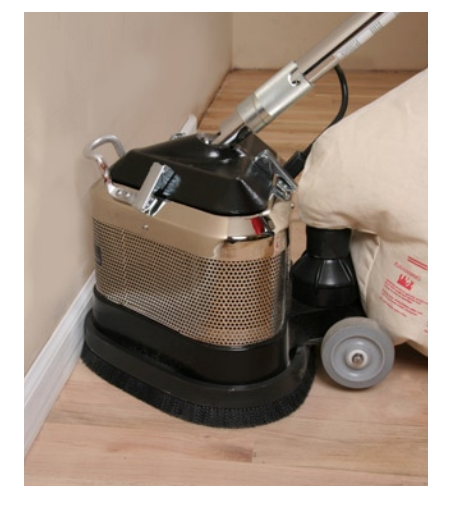
The three-head sanding design will sand the entire floor, including edges and wall lines.