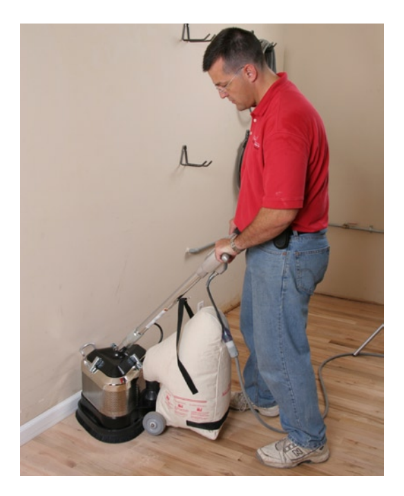
The EZ-Sand provides new and innovative orbital sanding action, while its unique and compact design allows it to sand almost anywhere.