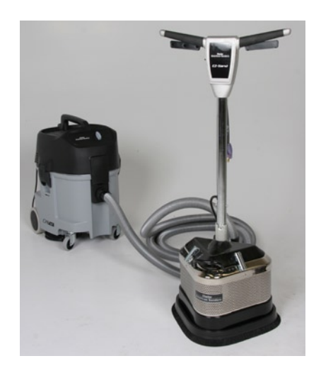
For superior dust collection, combine the EZ-Sand with a dust control vacuum from Clarke American Sanders