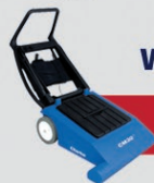
Wide Area Vacuum – 28 inch (71 cm) cord-electric