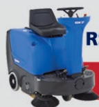
RSW 37 – 37 inch (94 cm) battery-powered rider sweeper