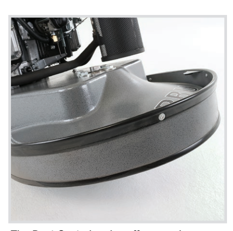
The Dust Control series offers a unique floating shroud that directs the high velocity airflow near the floor to collect six times as much dust as competitive models.