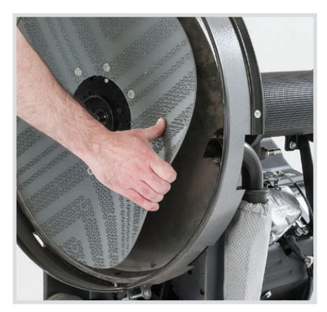
Balanced pad drivers reduce vibration and are flexible to follow the contour of uneven surfaces over floors.