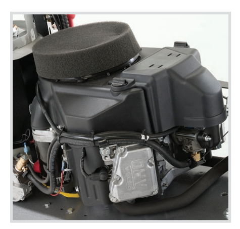
All models have Kawasaki Twin-V engines that provide maximum power.

When you need floor equipment to quickly burnish large surface areas to a high gloss, turn to the manufacturer who provides the most power available. Clarke<sup>®</sup> propane-powered burnishers are available in 21 inch and 27 inch path sizes, so you can choose the best match for your productivity needs. The Dust Control Series also offers superb dust control which is often critical for retail stores, office buildings, educational institutions, supermarkets and sports facilities.