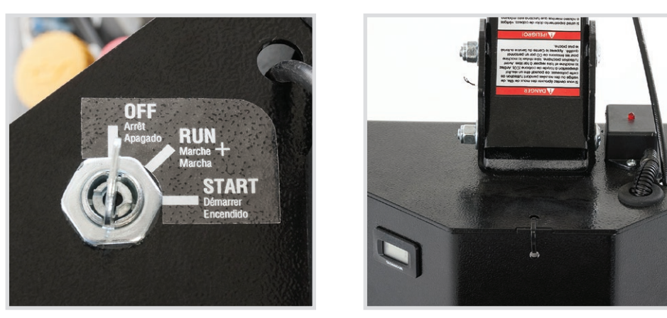
Controls include electric key start switch, hour meter and optional CARB Gard<sup>™</sup> emissions monitor.