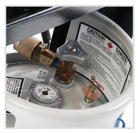
Large 20 pound 80% safety fill propane tanks offer long working time between refills and also prevents overfilling.