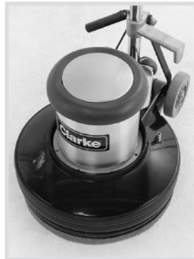
Cast aluminum chassis and 66 frame motor.