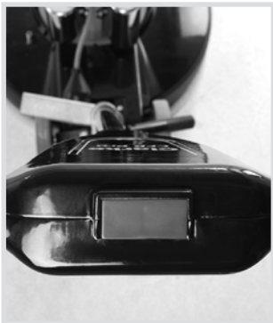
Safety lock-out switch.

The CFP Pro® 17HD and 20HD floor machines are rugged, high powered machines built for years of use in a wide range of applications. With easy-to-use fingertip controls and multiple safety features, such as handle-mounted safety switch, and a 50 foot yellow cord, these all metal construction machines are designed for heavy duty use. The handle lock can be actuated by foot, and there is a convenient cord wrap for cord storage when not in use.