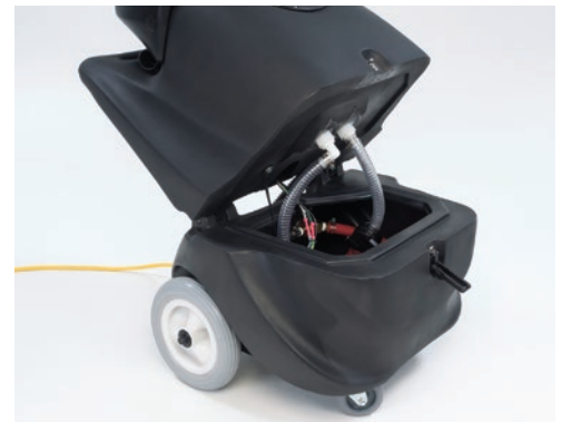
Clamshell design for easy servicing.

The WP630™ from Clarke is designed to be the most efficient and effective way to extract water from carpet at any water damaged facility. This new and innovative design has increased the efficiency of the airflow by top mounting dual 3-stage vacuums, thus eliminating stand-pipes and bends into the tank. This significantly reduces restrictions in airflow and increases efficiency. Powerful yet efficient, the 3-stage vacuums only use 13 amps of power with one cord which is ideal for flooded sites where power may be limited. The WP630's ergonomic and lightweight design makes it easy to handle by one person with little or no bending or stooping. Large rear wheels carry the WP630 up and down stairs or nearly anywhere you need it to be, to complete the job with little effort or strain. To increase productivity, two (2) diaphragm bilge pumps automatically and continuously remove the waste water from the 9 gallon recovery tank through a standard 3/4 inch garden hose at 10.5 gpm, thus eliminating the need to stop and empty the tank.