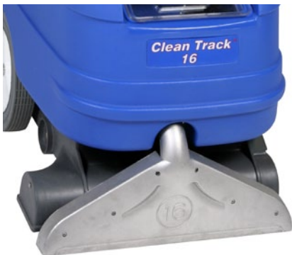
The vacuum shoe is designed with laminar flow technology allowing more moisture recovery, resulting in fast drying times.