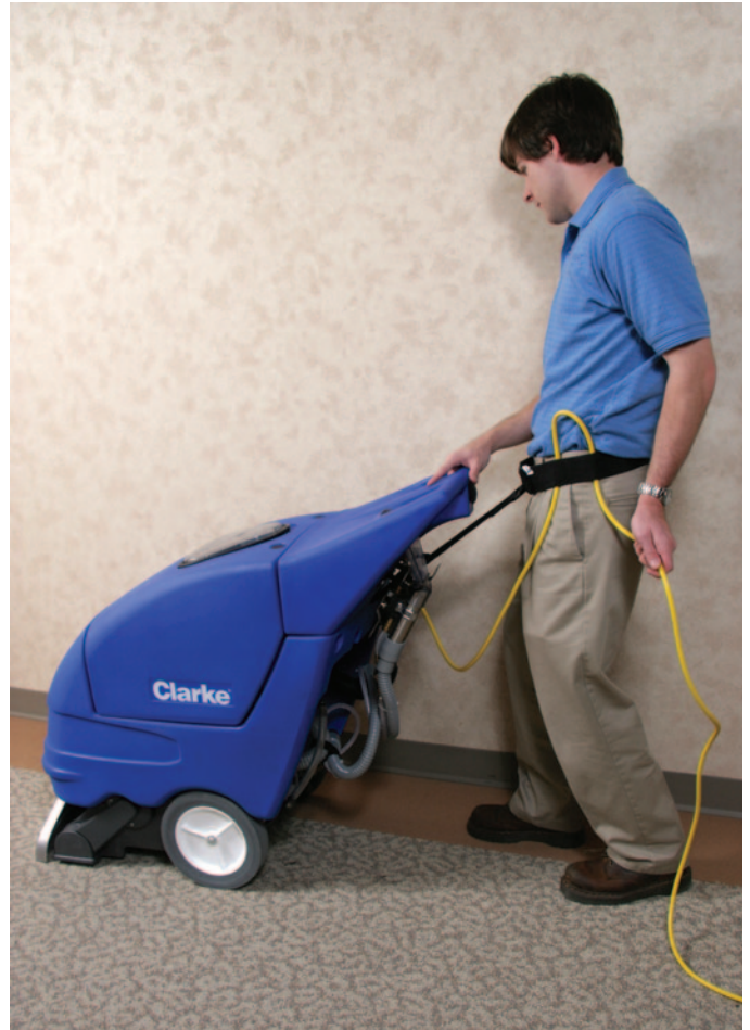
The Clean Track series machines are classified by Clarke as green machines by reducing operator strain.