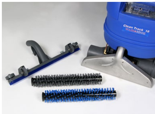
The quick change hard floor kit option turns your extractor into a dual purpose machine. No tools required.