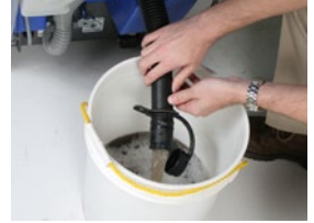
High dump drain into toilet or bucket.