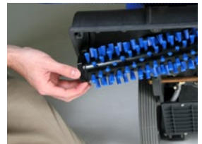
The 16 or 18 inch scrub brush can be removed and installed without the use of tools.