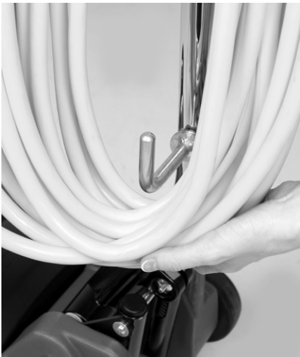
A quick release cord wrap assists the removal of the power cable without unwrapping.