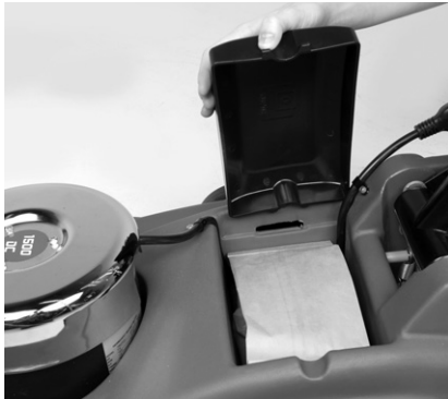
Passive dust control eliminates airborne dust and collects it in a convenient filter bag.