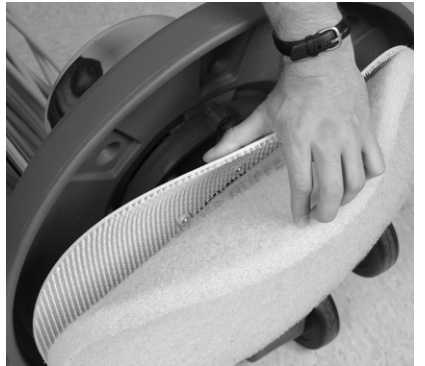
Flexible pad driver with full face pad grip contours to uneven floors.